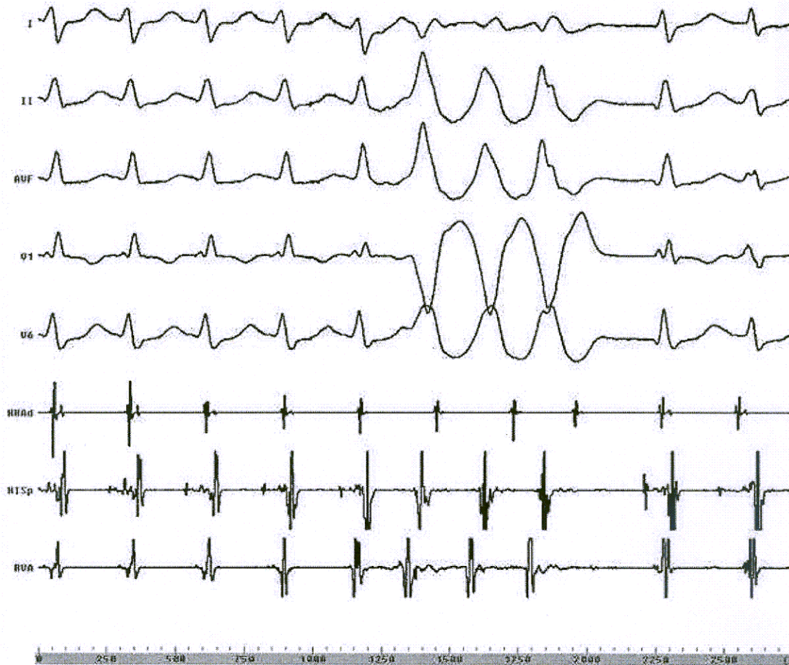
Figure 2. Entrainment of the supraventricular tachycardia by a short run of non – sustained tachycardia. Surface leads I, II, aVF, V1, V6 and intracardiac recordings from the high right atrium (HRAd), His bundle (HISp) and right ventricular apex (RVA) are shown.